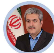
Dr. Sorena Sattari Vice President for Science and Technology