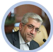
Dr. Reza Ardakaniyan Minister of Energy