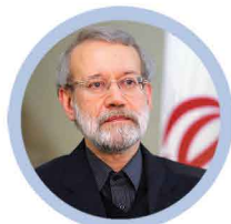
Dr. Ali Larijani Chairman of the Iranian Parliament