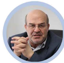
Dr. Issa Kalantari Vice president and Head of Department of Environment