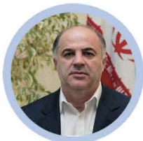
Mr. Homayoun Haeri Deputy Energy Minister for Electricity and Energy